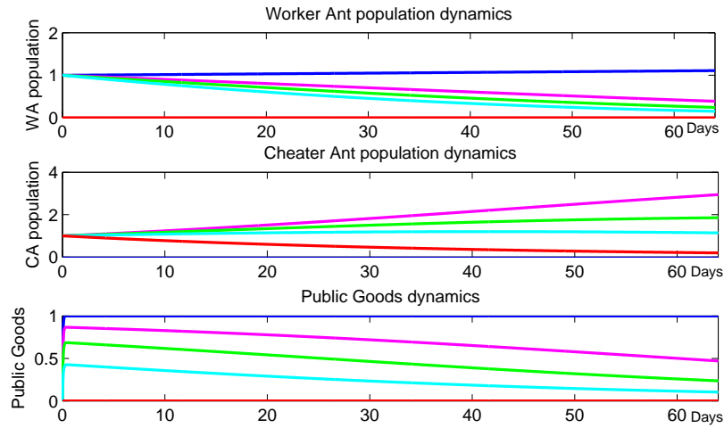
Figure 2: Simulation for the worker population, cheater population and Public Goods in five cases format. Blue: Case 0, Pink: Case 1, Green: Case 2, Cyan: Case 3 and Red: Case 4.